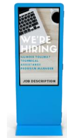
X1 MINI BANNER