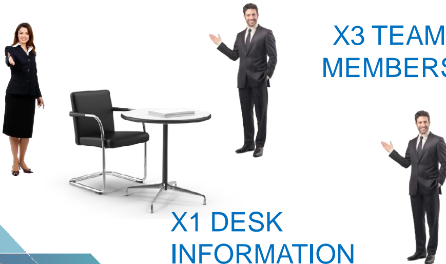
X1 DESK INFORMATION